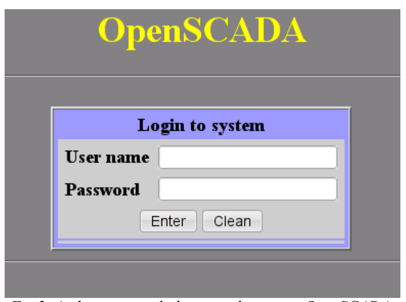
Fig.2. Authentication dialogue in the system OpenSCADA.

Module supports authentication in the system OpenSCADA while providing access to the WEBinterface modules (Fig.2). Dialogue is formed in the language of XHTML 1.0 Transitional!